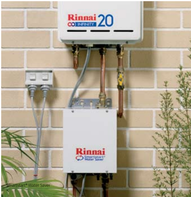
Smartstart® Water Saver

The following accessories are available for the Rinnai Continuous Flow Models.