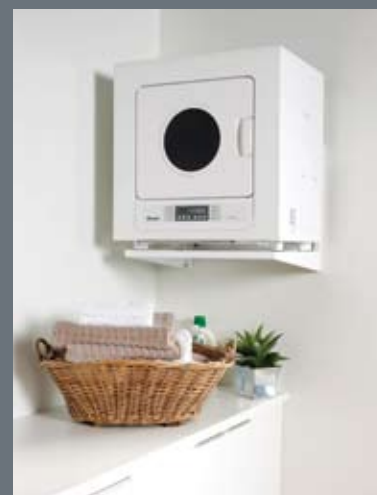
Gas Clothes Dryer