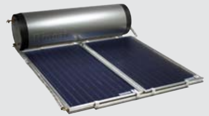
Close Coupled System with Excelsior Collectors