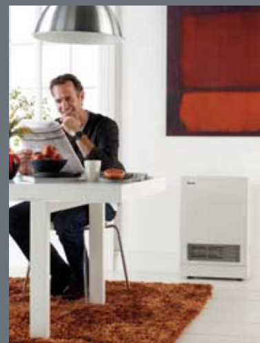
Energysaver® Flued Gas Space Heating