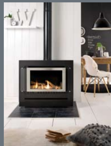
Sapphire Gas Log Flame Fire