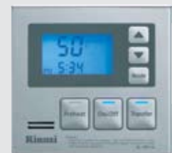
Deluxe Kitchen Controller