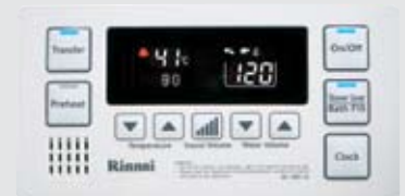
Deluxe Bathroom Controller