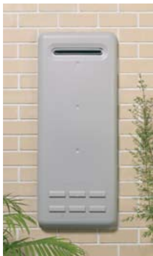
Wall Cavity Recess Box