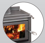
Black Trim Kit